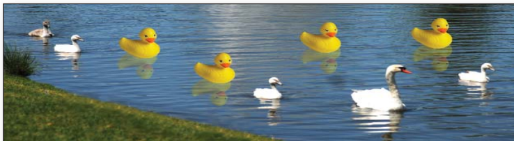
Ducks race to find a cure for leukemia.