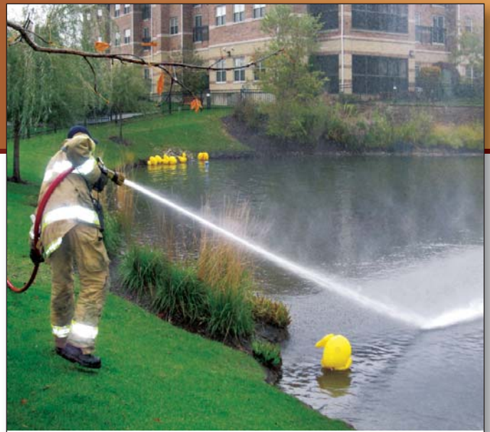
Fire hoses propel rubber duckys toward the finish line at Alden of Waterford fundraiser for The Leukemia Research Foundation.