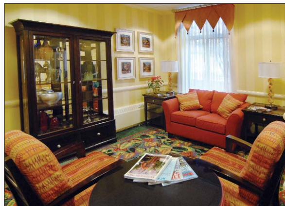
Long-Term Living magazine: Alden Estates of Barrington's lobby is 'welcoming and conducive to socialization.'

The article describes specific design elements incorporated during a total renovation of the facility in 2006, including "warm, rich color tones that complement the wood finishes and crown moldings. The jewel-like colors inspire confidence and provide a cheerful atmosphere, while the leaf motif infuses the project with a lively, energetic and organic feeling."